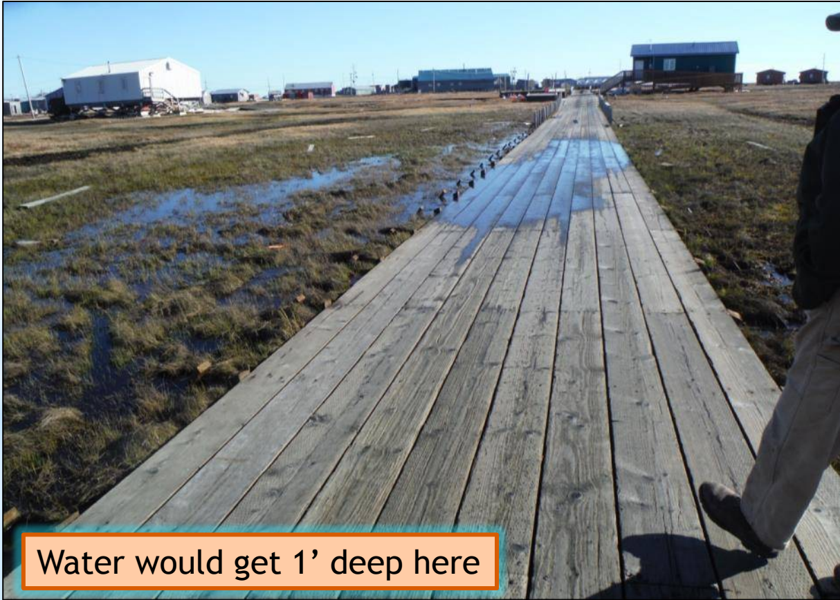
Water would get 1' deep here