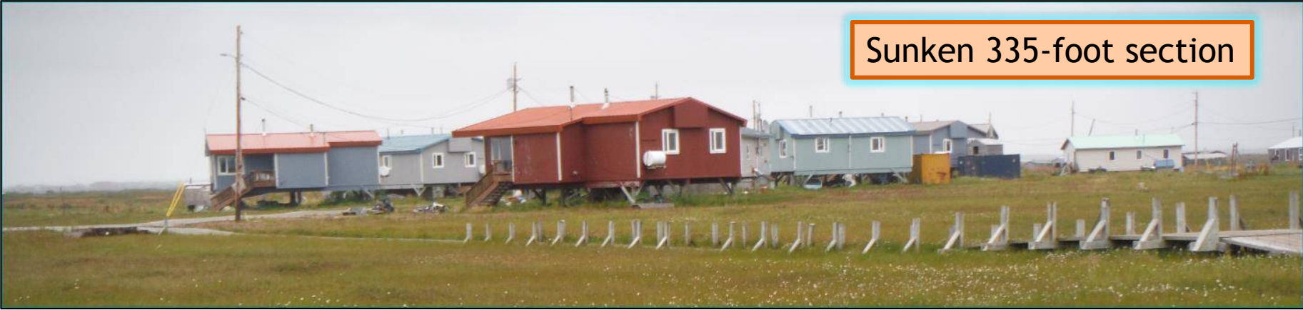
Sunken 335-foot section