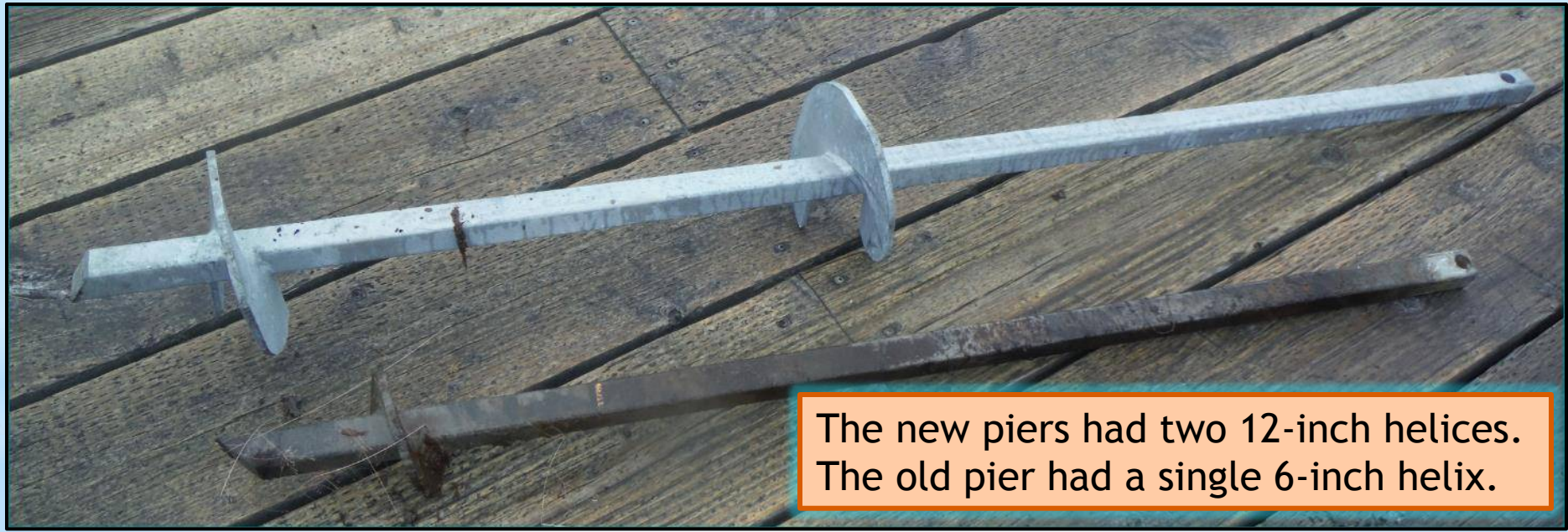
The new piers had two 12-inch helices. The old pier had a single 6-inch helix.