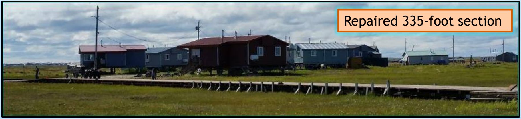
Repaired 335-foot section