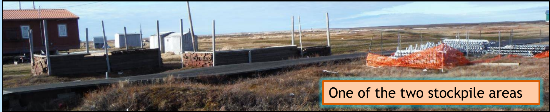
One of the two stockpile areas