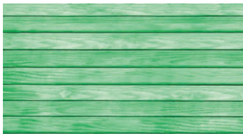
FrameGuard Coated Wood